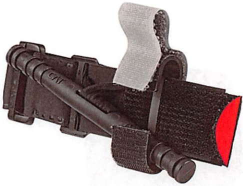
CAT Tourniquet (Black)