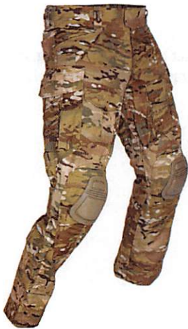
CRYE PRECISION G3 COMBAT PANT with AIRFLEX Combat Knee Pads