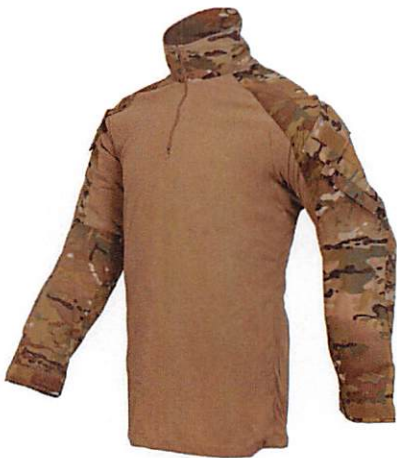
CRYE PRECISION G3 COMBAT SHIRT